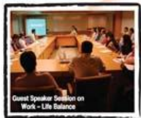
Guest Speaker Session on Work - Life Balance