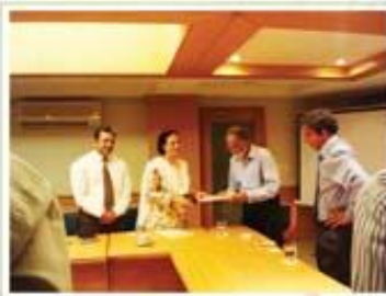
Agreement between Maple Pharma & Biogenics