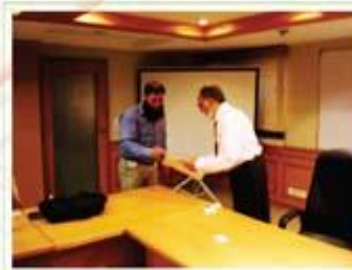
Agreement between Maple Pharma & Avital Pharma