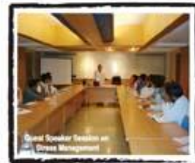
Guest Speaker Session on Stress Management